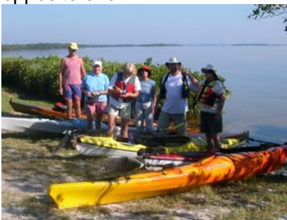
Getting ready to launch at Underhill Creek